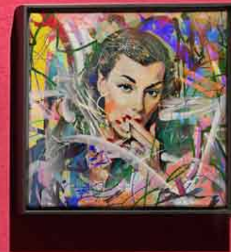
COVERT AND DISCOVERED HISTORY 245 WHEN SMOKING WAS A FEMINIST ACT SPRAYPAINTING/DRAWING/OVERPAINTING GÜNTER KONRAD 2020