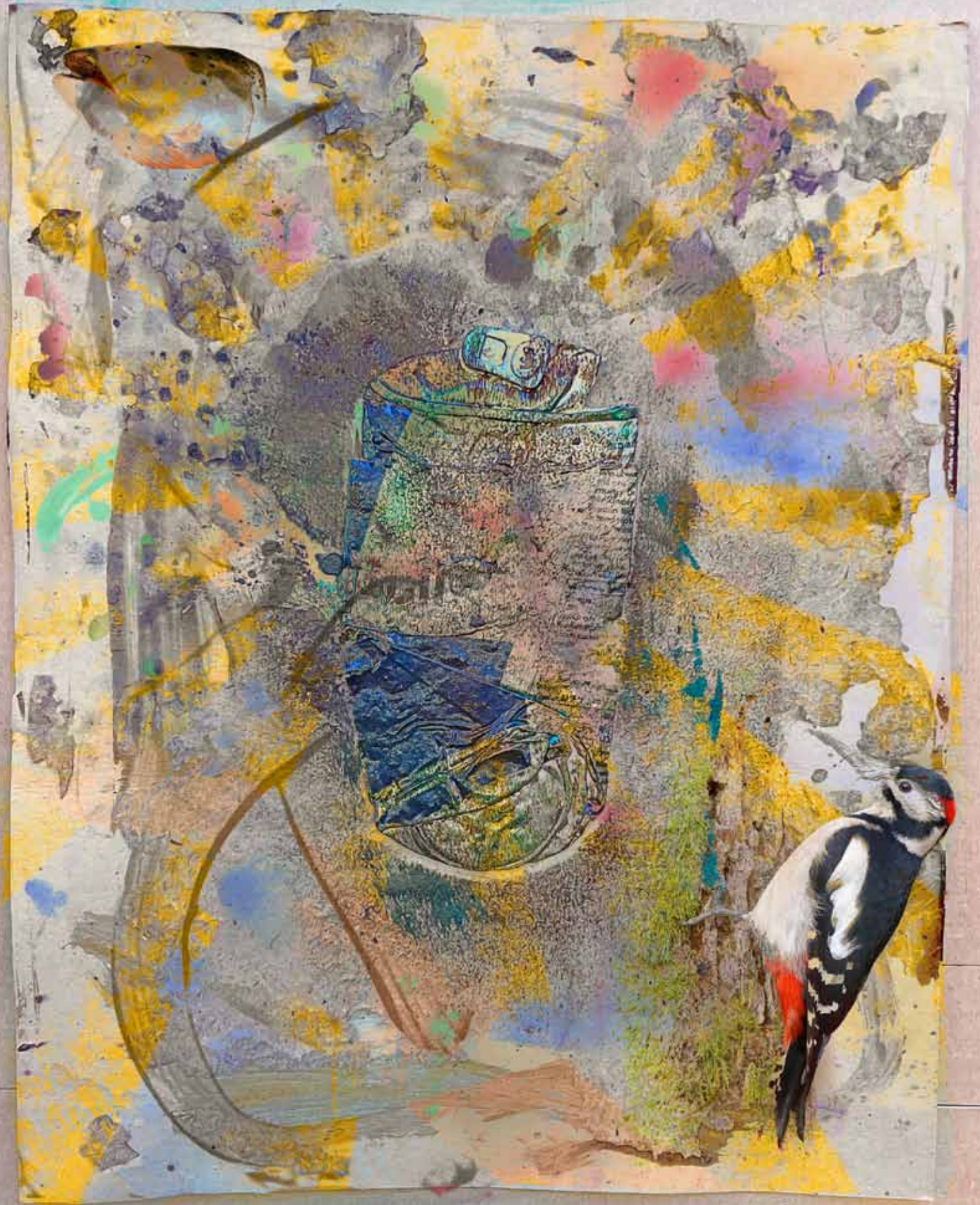
THE WOODPECKER, THE FISH AND THE CAN