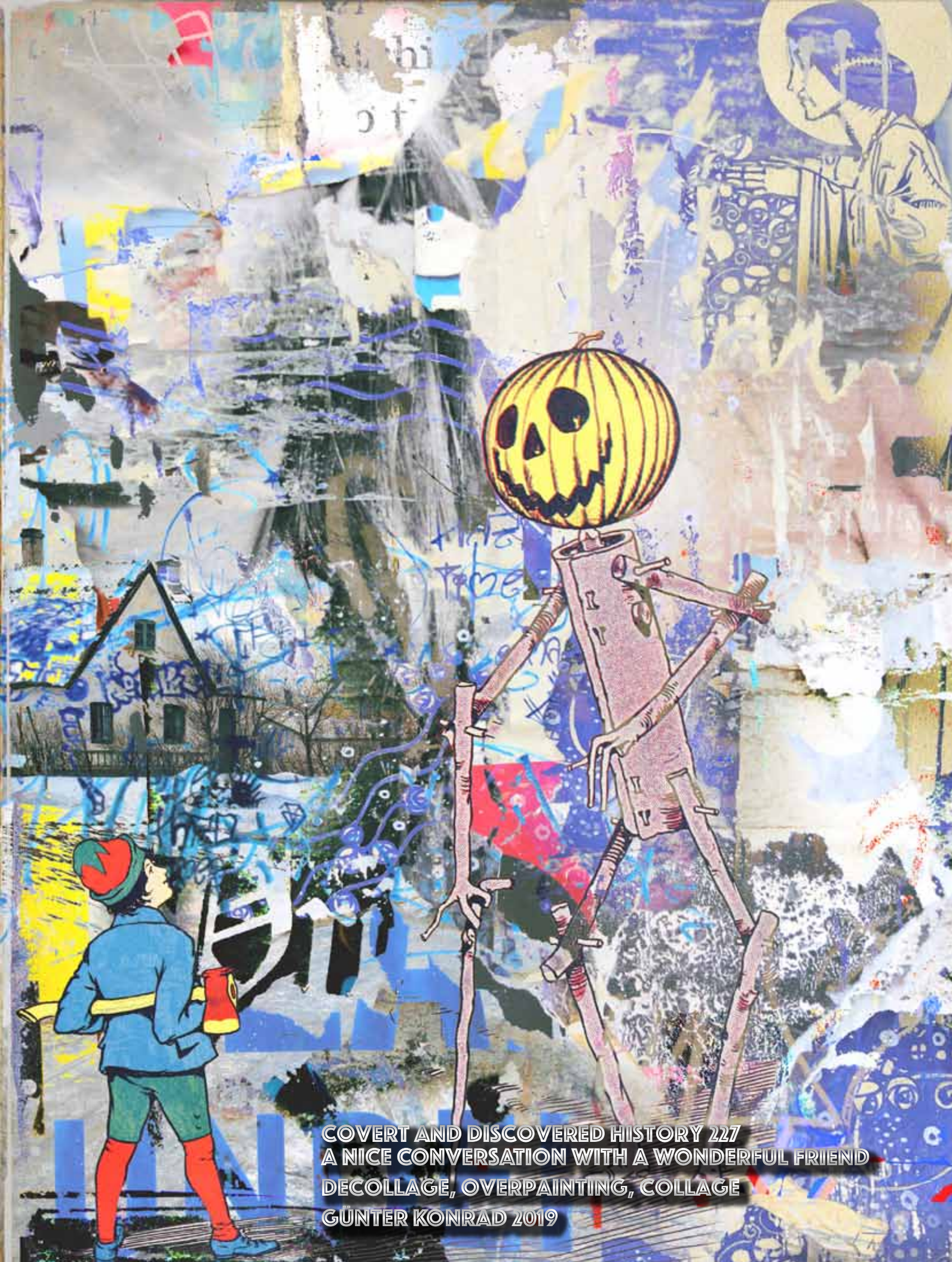
COVERT AND DISCOVERED HISTORY 227 A NICE CONVERSATION WITH A WONDERFUL FRIEND DECOLLAGE, OVERPAINTING, COLLAGE GÜNTER KONRAD 2019