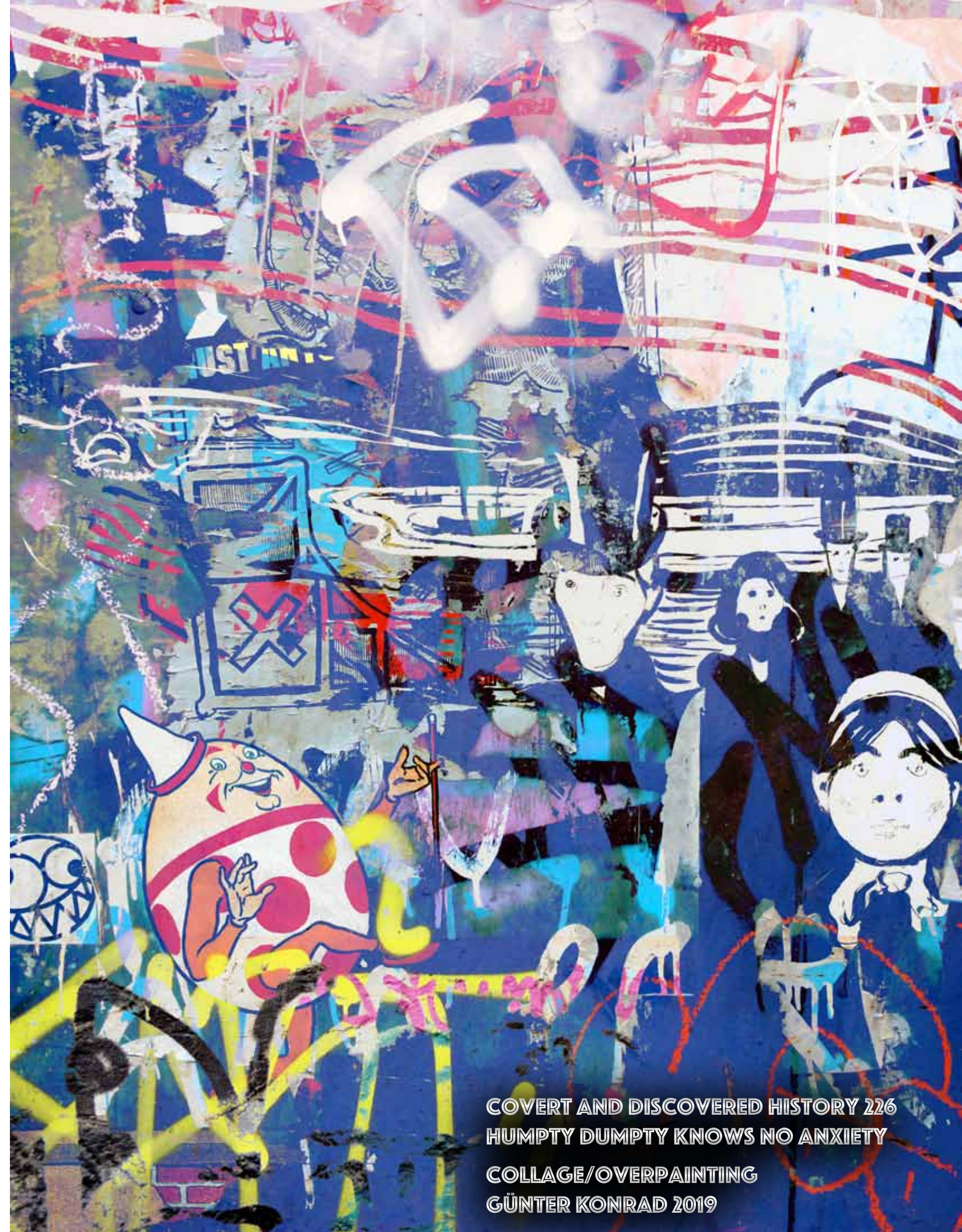
COVERT AND DISCOVERED HISTORY 226 HUMPTY DUMPTY KNOWS NO ANXIETY COLLAGE/OVERPAINTING GÜNTER KONRAD 2019