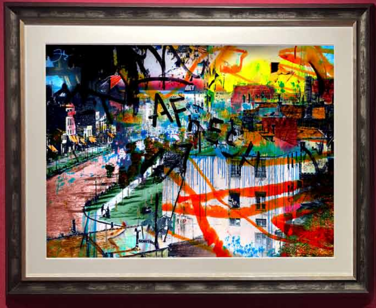
COVERT AND DISCOVERED HISTORY 128 BOULEVARD DU TEMPLE OVERPAINTING GÜNTER KONRAD 2014