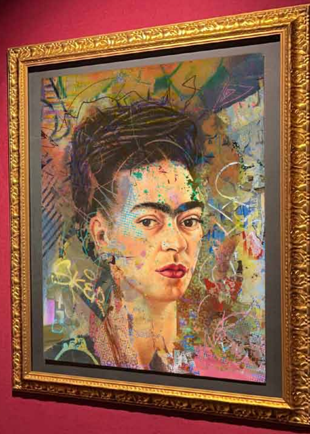
COVERT AND DISCOVERED HISTORY 253 FRIDA KAHLO WACOT DRAWING/OVERPAINTING/SPRAYPAINTING/COLLAGE GÜNTER KONRAD 2021