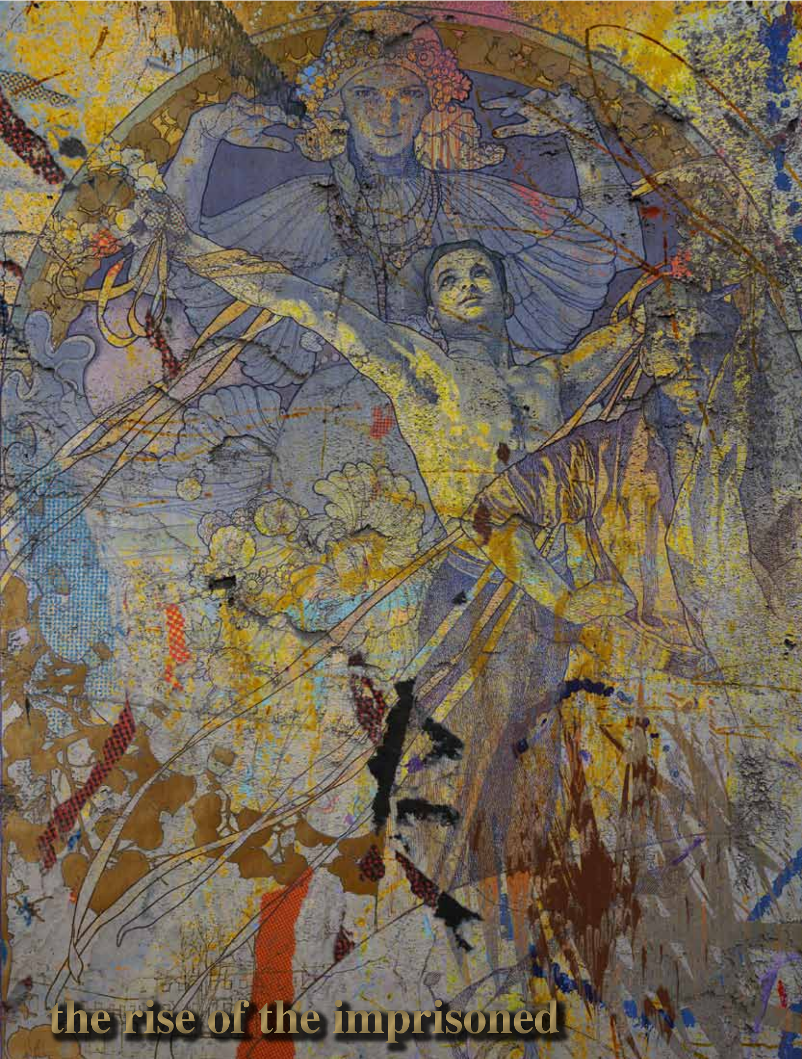
the rise of the imprisoned