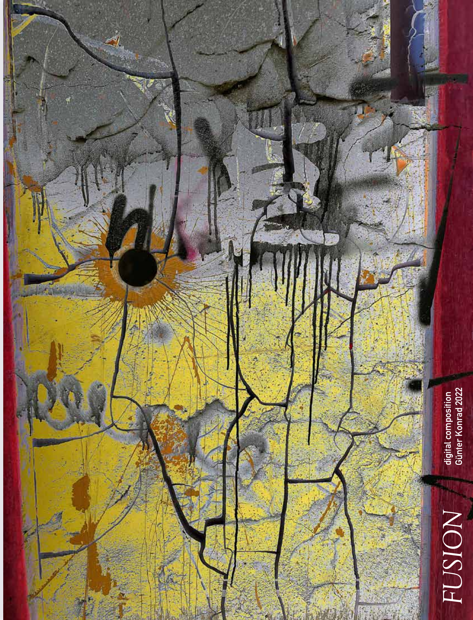
digital composition Günter Konrad 2022