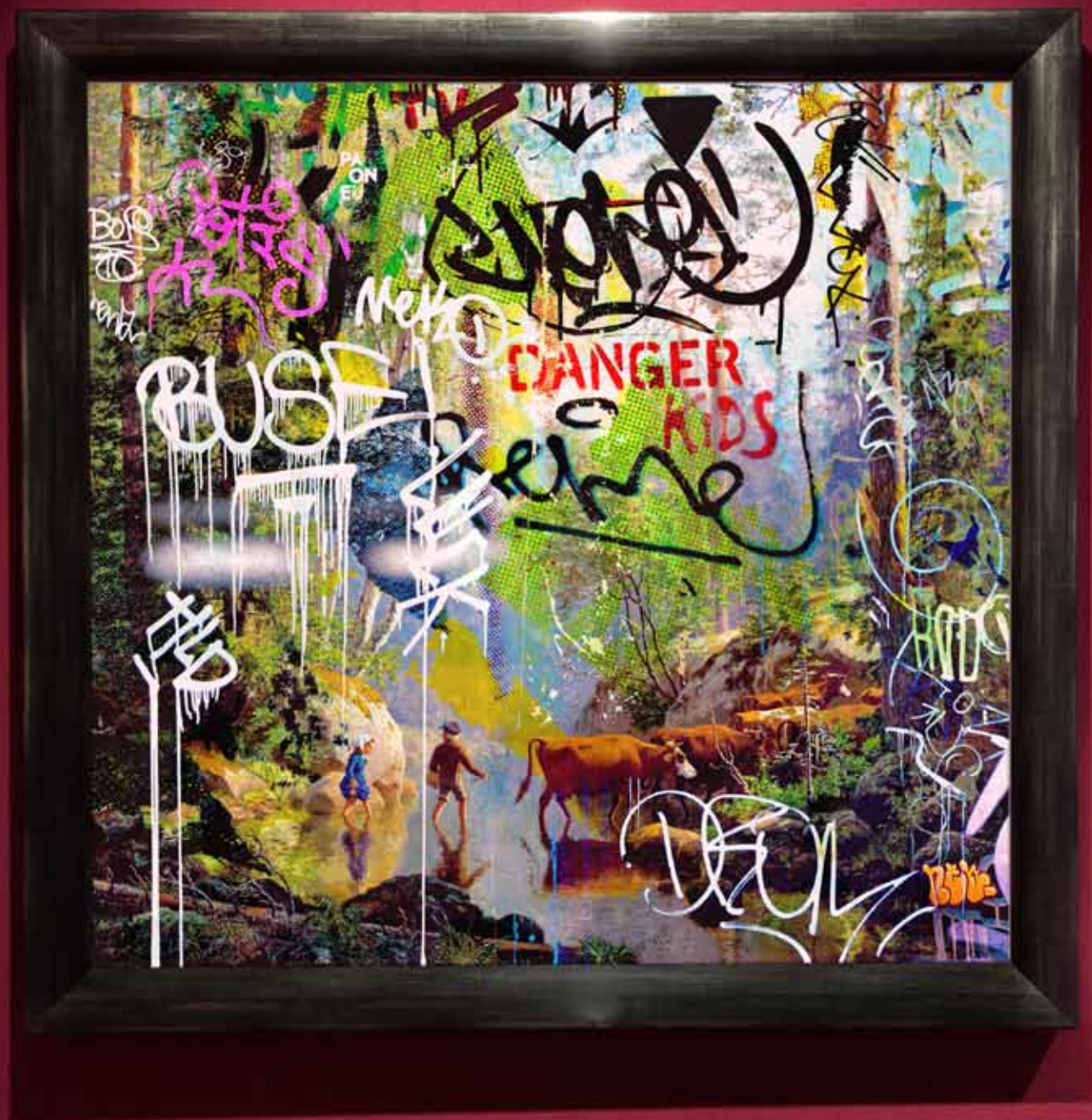
COVERT AND DISCOVERED HISTORY 168 DANGER KIDS OVERPAINTING, COLLAGE/DECOLLAGE GÜNTER KONRAD 2016