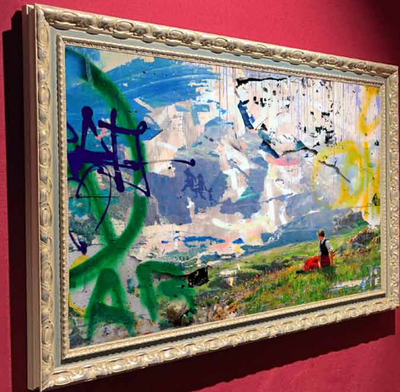
COVERT AND DISCOVERED HISTORY 181 REFUGEES WELCOME DECOLLAGE/COLLAGE/OVERPAINTING GÜNTER KONRAD 2017